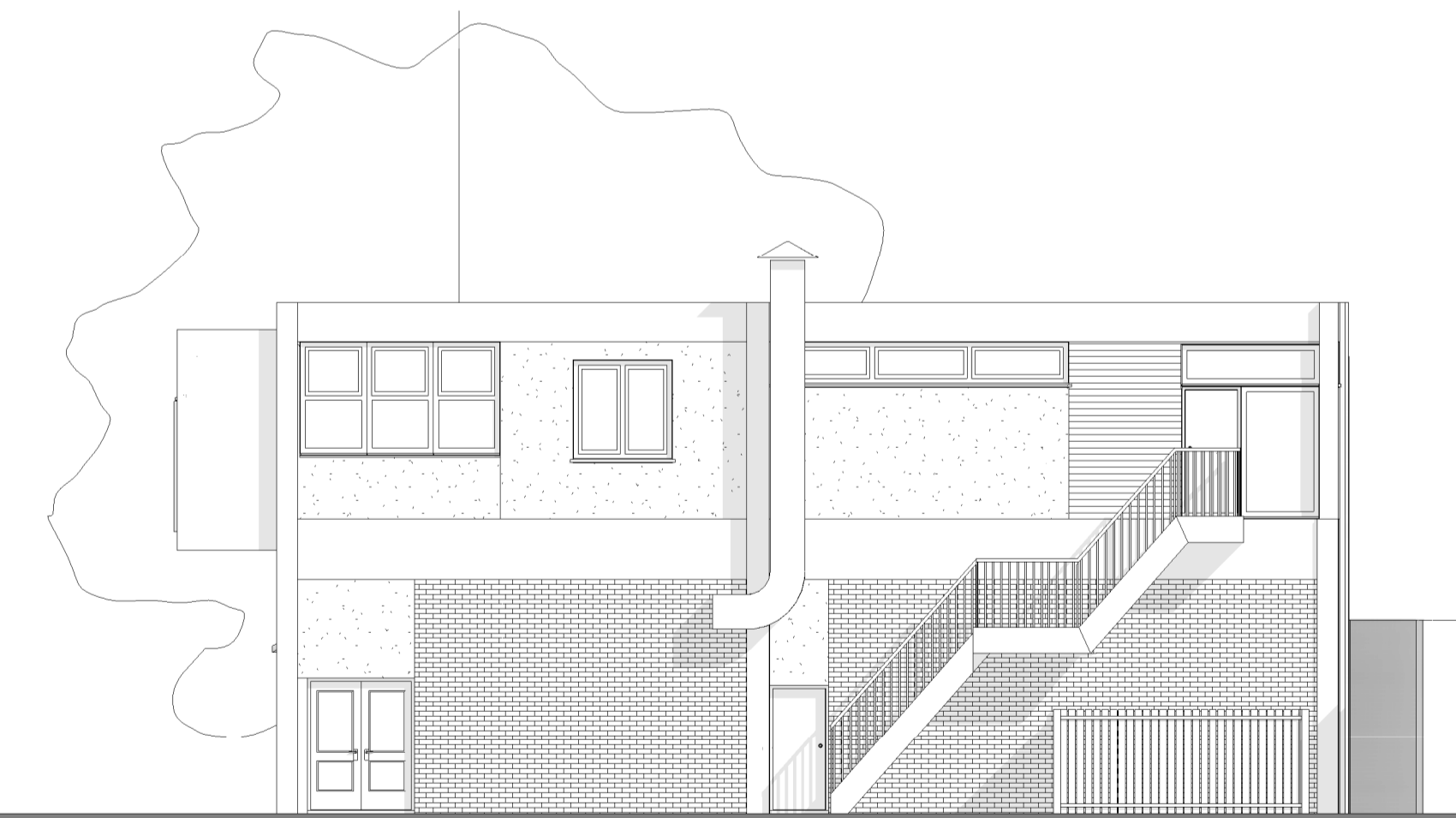
4 Existing Elevation - West 1 : 100